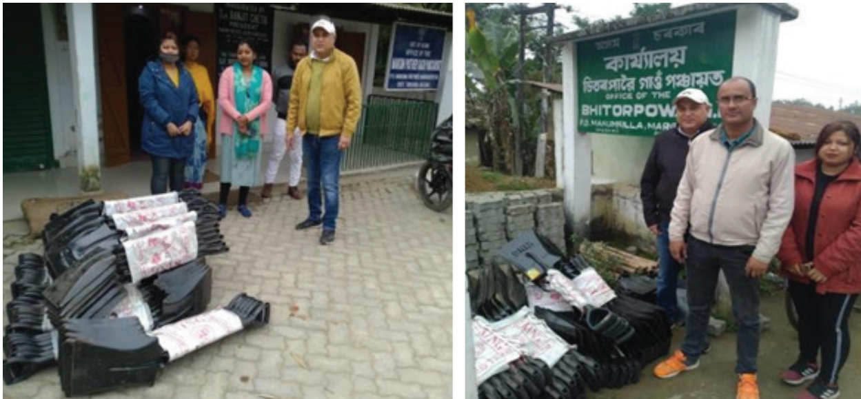
Distribution of Agriculture Tools to Village Panchayats in Margherita Block to help the Panchayat in effective functioning of work under Mahatma Gandhi National Rural Employment Guarantee Act (MGNREGA).