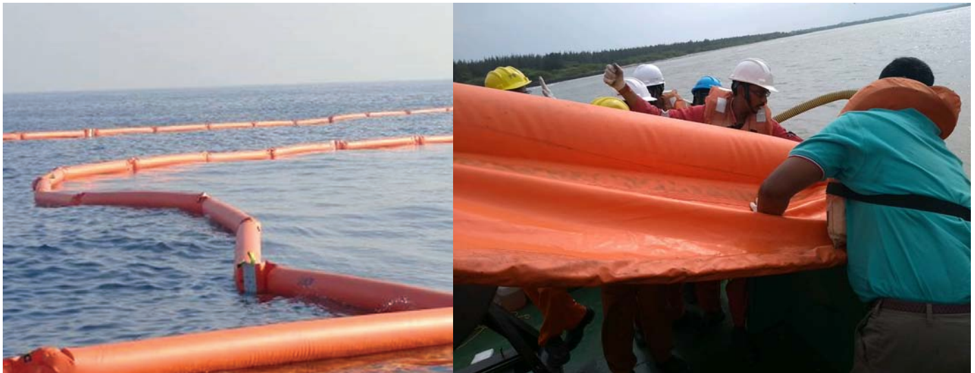
Oil Spill Containment Exercise

Effective response to a marine oil spill requires mobilization of resources depending on a number of factors. One of the most critical factors is the time taken to activate the plan and mobilize equipment & resources to the scene of the spill. To ensure efficiency of response, a tiered approach is adopted by HOEC management in line with NOS-DCP and OISD guidelines. This plan takes into account the response time needed to mobilize, transport and deploy increasing amounts of resources to the scene of a spill depending upon its size.