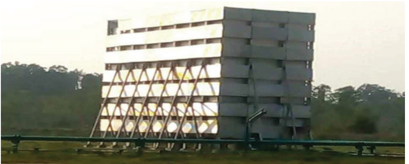
Flare Enclosure at Modular Gas Processing Plant in Assam

Another system called the ground flare (300-X-003) is a sonic, natural draft, horizontal flare system fitted with six burners, four pilots, one ignition control panel and one flare header. The flare and piping to the flare are sized for 35 mmscfd. A fence is provided around the ground flare to guarantee that the flames are concealed, thereby preventing exposure to the surrounding environment. In FY 2020-21, the Dirok team devised a new short shutdown procedure for the plant in order to avoid unwanted flaring of natural gas.