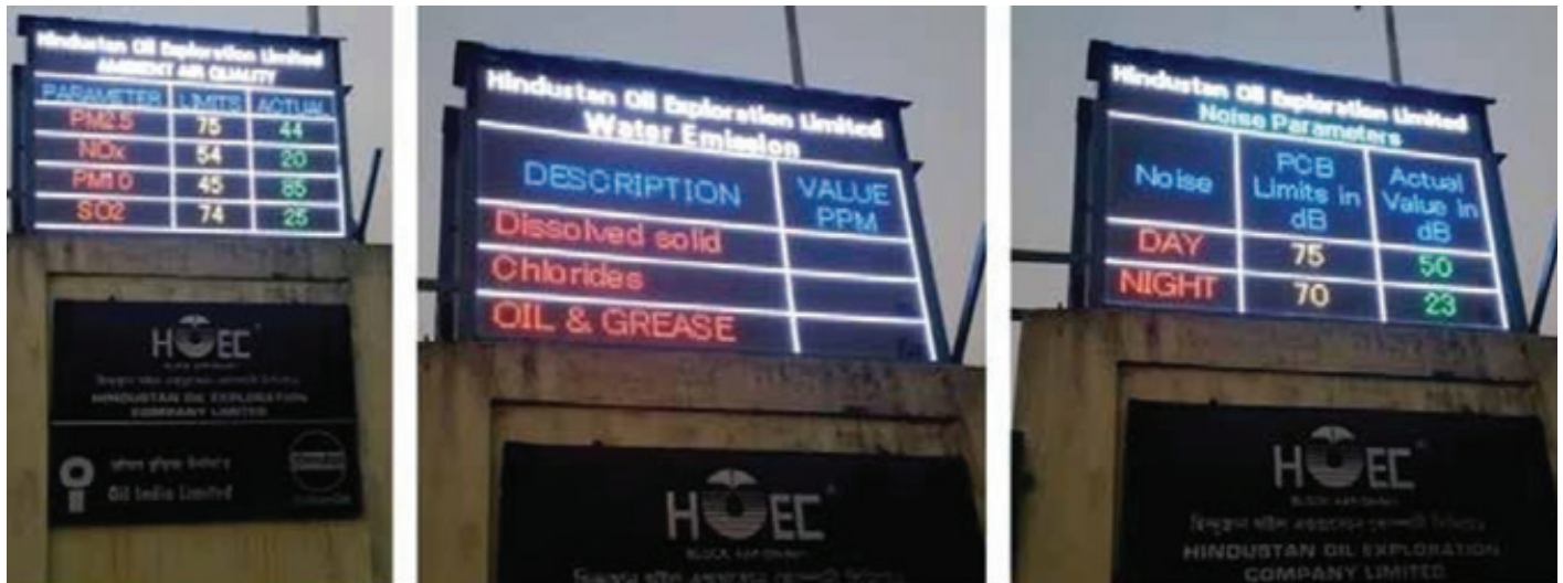
LED Digital Display at MGPP in Assam