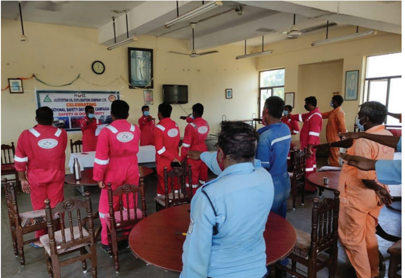
HOEC Employees and Contractors Taking a Safety Pledge