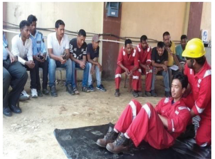
Training on "Rescue Carry" was Conducted by Fire Team at GGS