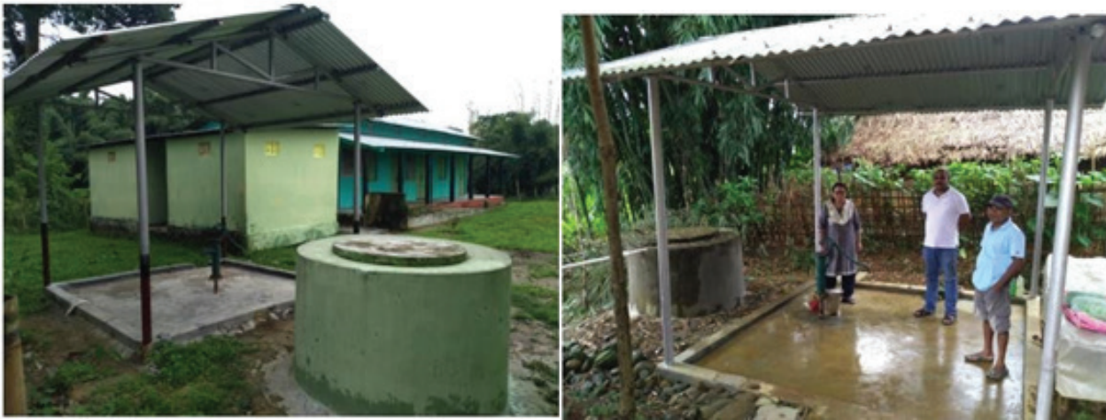
Construction of Dug wells for the people to access clean and safe water