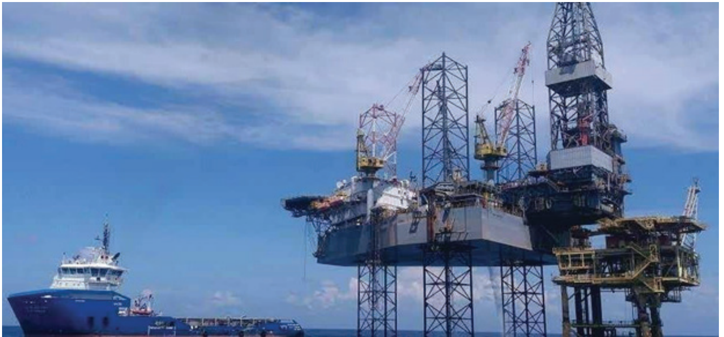
PY-1 Offshore Facility & Rig during Drilling Operation

Wastewater generated mainly contains domestic sewage and wash downs if any. The following measures are taken to ensure that no waste is discharged directly into the sea: (i) the Barge is equipped with suitable containment and treatment systems; (ii) deck washings are routed through an oil/water separator before being discharged into the sea; (iii) good housekeeping practices are adopted onboard the Barge; (iv) chemicals are stored in dedicated storage areas with containment provisions; (v) any oily waste or chemical waste generated, is brought back to the shore for proper disposal; and (vi) the sanitary effluents onboard are treated in a suitably designed Sewage Treatment Plant (STP) before being discharged into the sea.