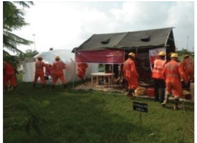
Joint Mock Drill on Disaster Management with NDRF and Mutual Aid Partners