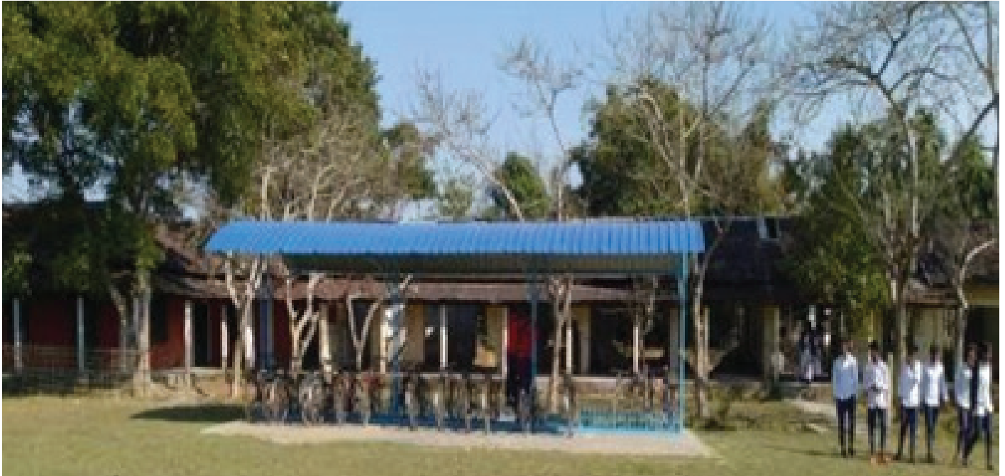
Cycle shed constructed in Powai high school