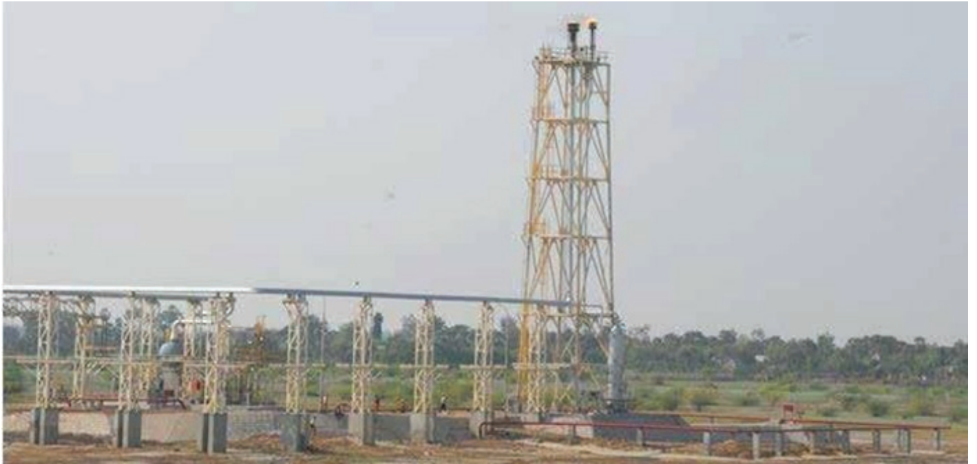
Flare Tower at PY-1

Another system called the ground flare (300-X-003) is a sonic, natural draft, horizontal flare system fitted with six burners, four pilots, one ignition control panel and one flare header. The flare and piping to the flare are sized for 35 mmscfd. A fence is provided around the ground flare to guarantee that the flames are concealed, thereby preventing exposure to the surrounding environment. In FY 2020-21, the Dirok team devised a new short shutdown procedure for the plant in order to avoid unwanted flaring of natural gas.