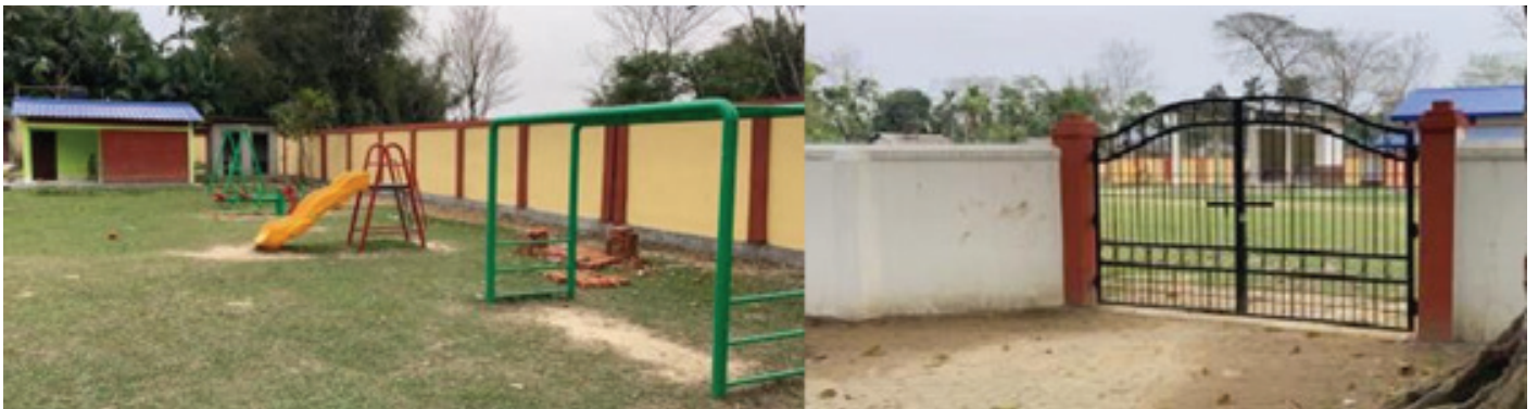
Compound wall constructed in Augbandha Primary Schools

School upgradation and infrastructure development has been undertaken in more than 2 schools in the past years. In the FY 20-21, HOEC constructed compound walls in Primary schools and Cycle shed in a high school.