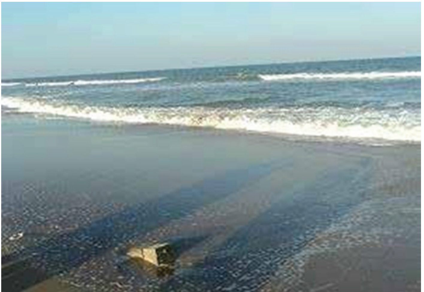
Marine Outfall Point at PY-1

The produced water generation has been reduced by optimizing the choke size efficiently. Plant wash water is connected to the contaminated rainwater storage system and the traces of oil recovered are pumped into the Slop Oil tank. No contaminated oil is discharged into the environment. During routine operations, no liquid waste generation occurs. However, there is a provision made for rain and storm water, as the water coming from the equipment may contain oil or other contaminants. Water production during the gas processing cycle can only be attributed to the slug catcher area. The degasser filters out the dissolved gases and minor traces of oil in the water and diverts the filtered water to the produced water holding pond on site. A deoiling hydrocyclone is utilized to separate oil from the produced water by means of centrifugal force. Water in the pond is periodically aerated and when the pond is sufficiently full, the water is sent back into the sea in the form of marine outfall. Marine outfall is tested periodically by an external laboratory, to ensure that it is compliant with relevant thresholds.