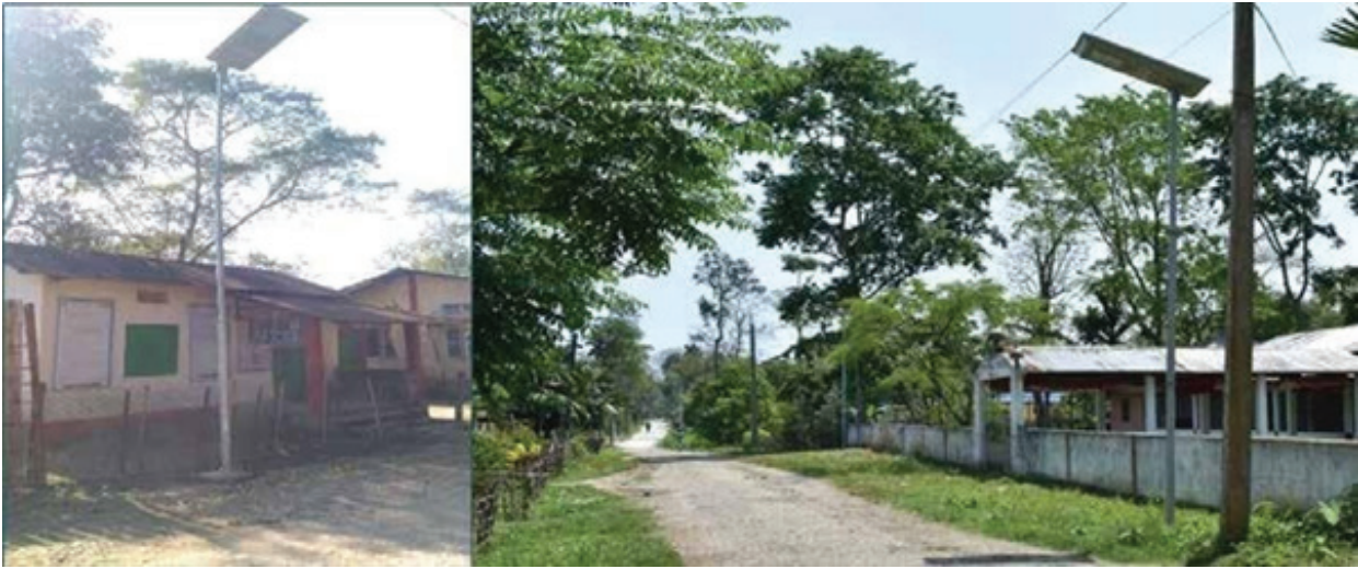
Solar Streetlamps Installed by HOEC in Augbandha & Kusijan Village