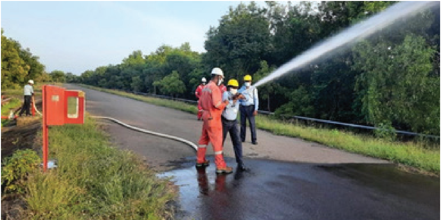
Figure: Firefighting Training Drill

In terms of training, a mandatory monthly health awareness training program is conducted at site. Safety and environmental awareness training on different topics are also administered internally on site. Standard operating procedures (SOPs) and training programs for accident prevention, personal protective equipment and workplace hazards are also in place. For those involved in offshore operations, Personal Survival Training (PST) is necessary. First-aid training and firefighting training are mandatory for all employees operating at site level. Furthermore, all members of the Oil Spill Response team at HOEC's PY-1 facility have successfully completed Level I of the Oil Spill Response Training program conducted by the Indian Coast Guard. Lost-time injury rate (LTIR) and all near miss incidents related to operational activity are tracked on a regular basis.